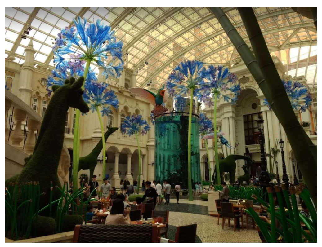
A view inside of the Wynn Casino with a tall aquarium as a center piece.