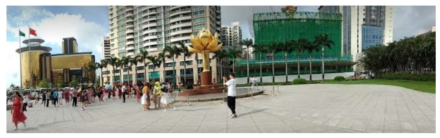
Landmarks by the apartment. The Sands and The Golden Lotus Park