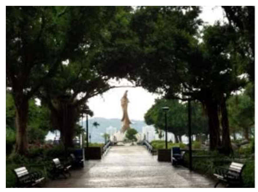
One of the many parks around the school