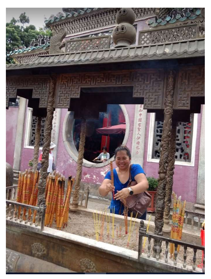
Lighting incenses at the A-Ma Temple.