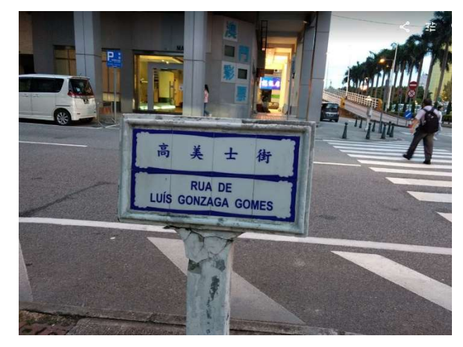
Street sign in front of the apartment