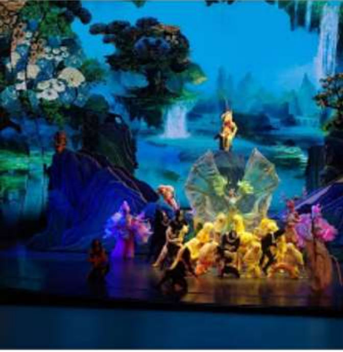
The Monkey King show at Sands Casino, Tiapa