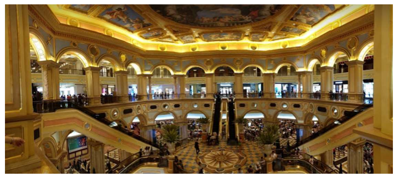
Views inside the Venetian Casino and Resort