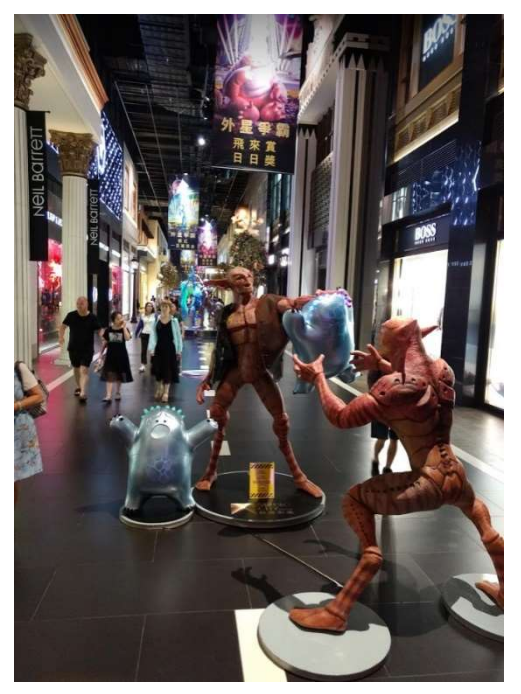
View inside Studio City Casino