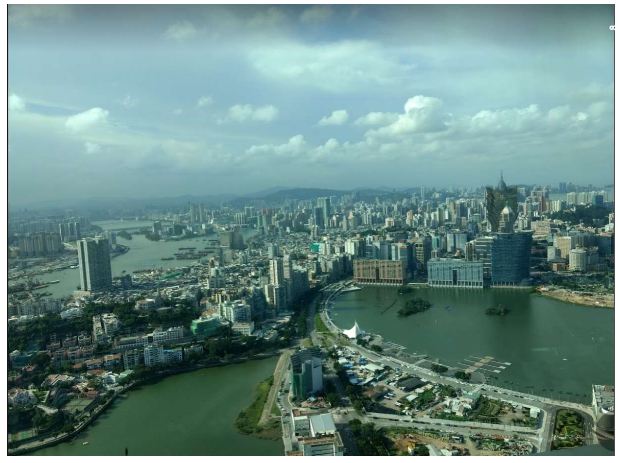
A view from the rotating Macau Tower