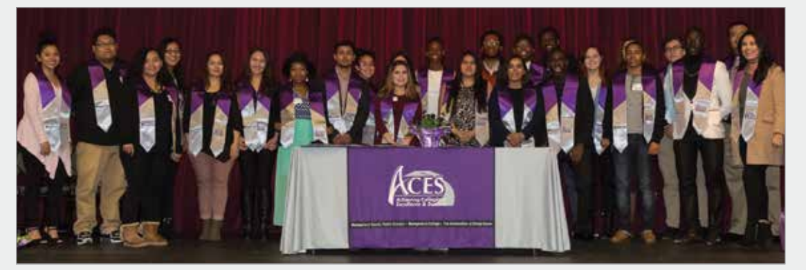
ACES students celebrate their academic achievements

Additional ACES students will graduate this summer