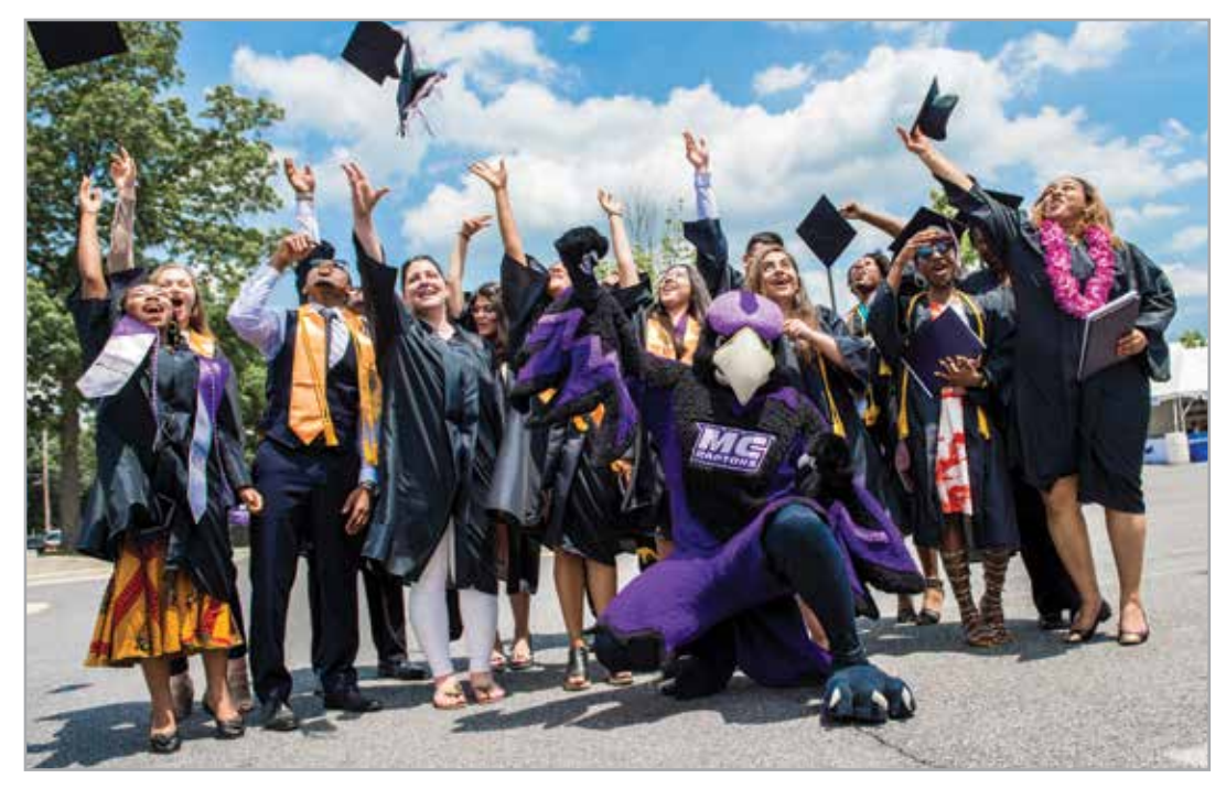
Raptor celebrates with 2017 graduates