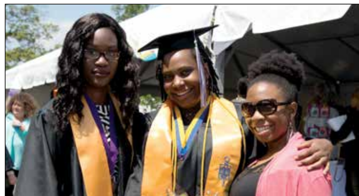
Montgomery College 2015 graduates celebrate at commencement in May.