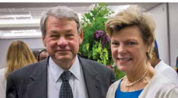
Steve and Cokie Roberts