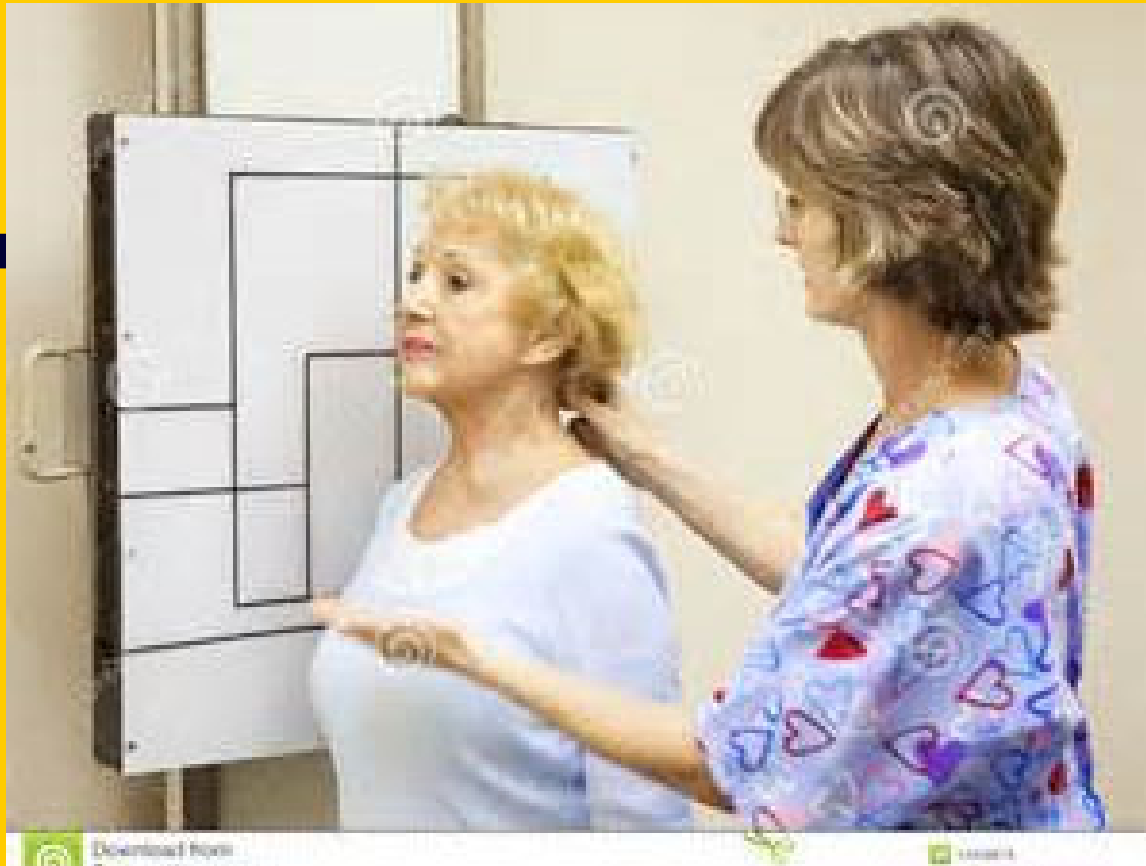
Taking x-rays in a radiography department