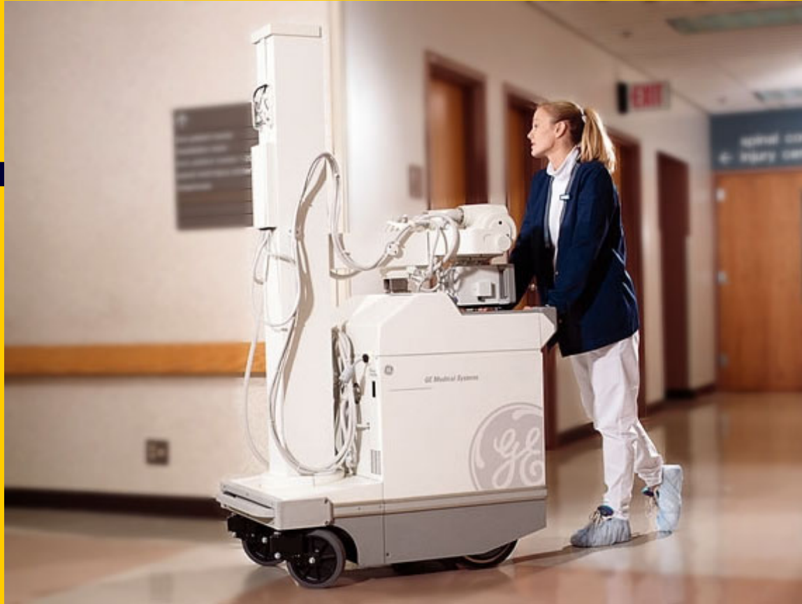
Taking Portable x-ray images