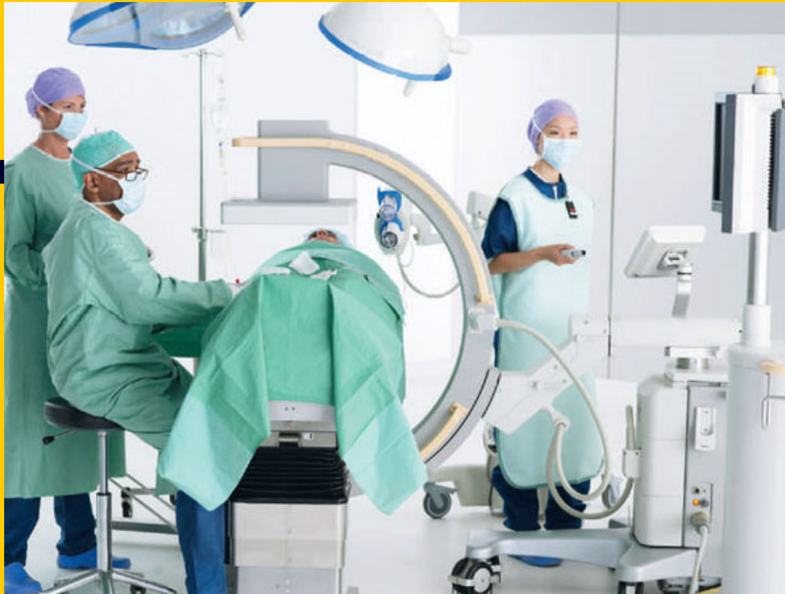
Taking images in the surgical suite